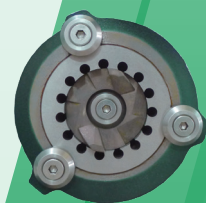
Shredding Ring and Cutter