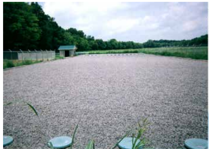
TENNESSEE 199 lot system - 60,000 GPD STEP collection system 55' x 217' recirculating gravel filter 10.4 acre - drip disposal fields